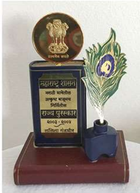
2003 Maharashtra Government Award

The inspiration for the novel was the many refugees the author met in India, Canada and the U.S. It is their story.